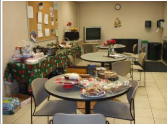
Christmas Dinner Served In NBPD Kitchen

Thank you to the New Berlin Police Department for your dedication and commitment to service!