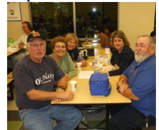
Part of the NBPCAAA BUYSEASONS Volunteer Group