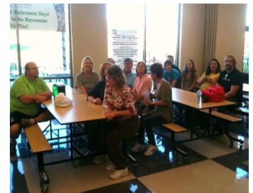
NBPCAAA Member Volunteers, Family and Friends

Being our first year doing the Community Outreach Fundraiser at BUYSEASONS our Association was able to raise almost $1,100.00. It was great to see members donate their time to work a 6 hour shift for two different Saturdays either being a "Packer" or a "Picker". Overall everyone said they would do it again so we hope to make this an annual fundraiser.